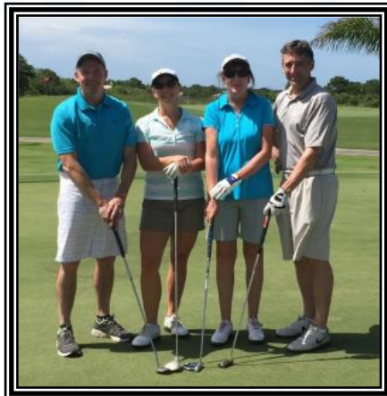
Other year-'round residents!