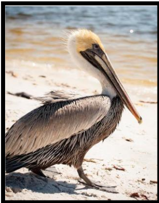
A good friend of Debbie Woodcock