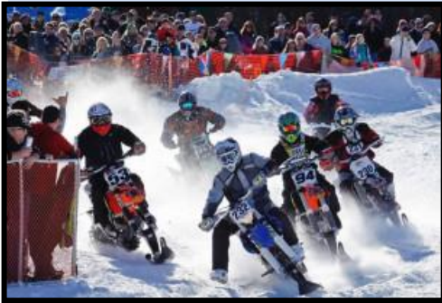
The Winter Carnival Idaho 2016 Snow Bike Race reminds us why we're here in Florida.

The immediate weather forecast calls for more sun and higher temperatures.