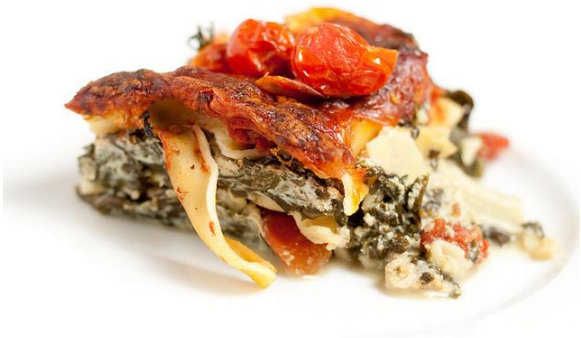
A full house of Williamsburgers at the cocktail party/ Italian Lasagna Dinner